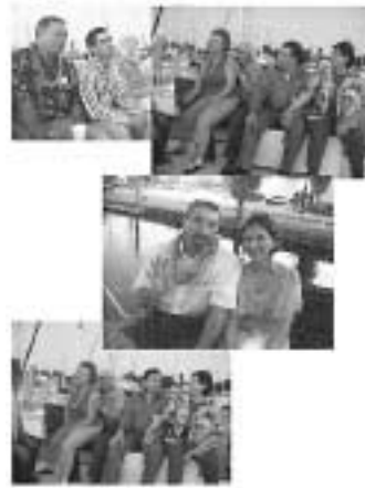
Island Princess flotilla takes conventioners out for a cruise, returns with several "lost" at sea by inebriation. Calm seas, beautiful harbor lights.