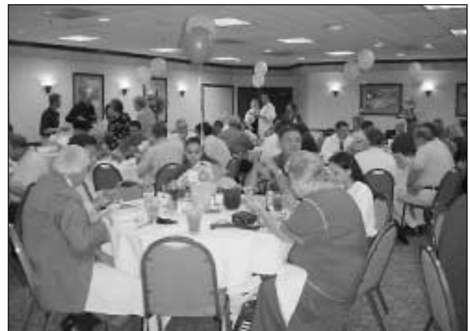
Convention lunch - Sponsored by El Dorado Insurance